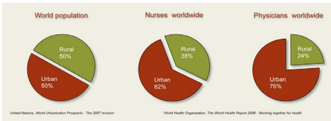
Figure 2. Rural/urban worldwide distribution of physicians, nurses and population

In the majority of countries, rural and remote areas are usually lacking sufficient numbers of health workers. Approximately one half of the global population lives in rural areas, but these areas are served by only 38% of the total nursing workforce and by less than a quarter of the total physicians' workforce (figure 2). At the country level, imbalances are even more prominent (see section 2). There are also countries, such as some francophone sub-Saharan African countries (Cote d'Ivoire, Mali, Democratic Republic of Congo), where there is large overproduction of health workers, with medical unemployment in urban areas, and at the same time with shortages in rural areas. Other countries have apparently a sufficient numbers on average, but with shortages in rural areas (Germany, France).