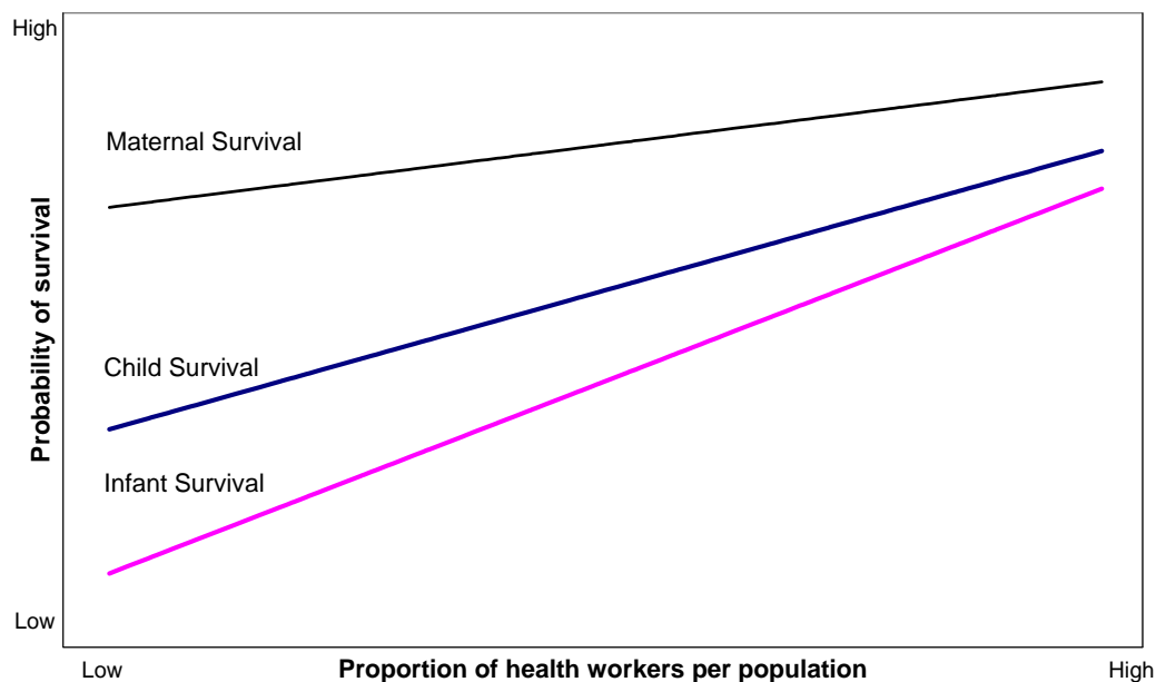
Figure 1. Density of health workers (doctors, nurses and midwives) and probability of survival